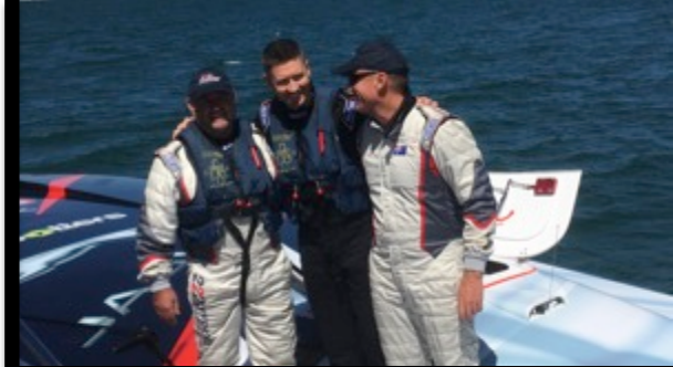
Michael Clarke, Australian Cricketer